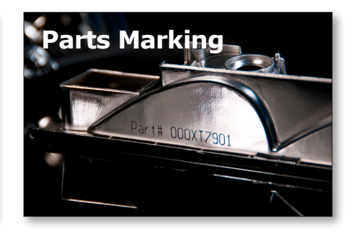
Apply permanent marks, text, and codes to variety of parts (both big and small) for faster, easier tracking.