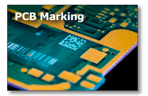
The perfect ultra-compact, lowpower CO<sub>2</sub> laser source for PCB marking and coding applications.