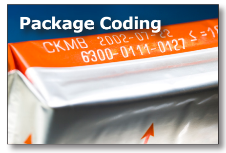
Easily applies permanent alpha numeric codes, barcodes, text, and expiration dates to a variety of packaging materials that will not smear or rub off.