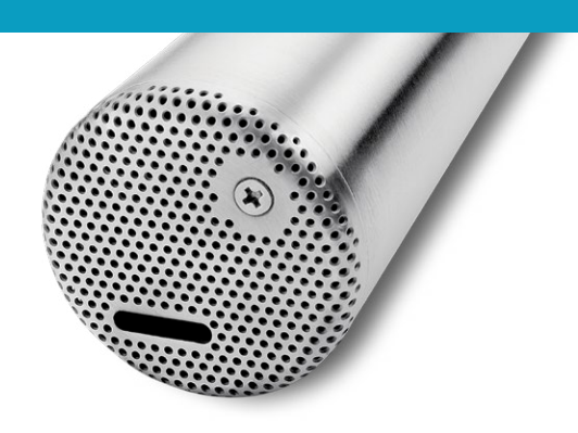
Perforated design reduces buildup and cleanings

* Available in all models except for the 1210 and 1220